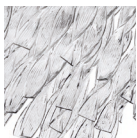
CS "Rigadin" crystal